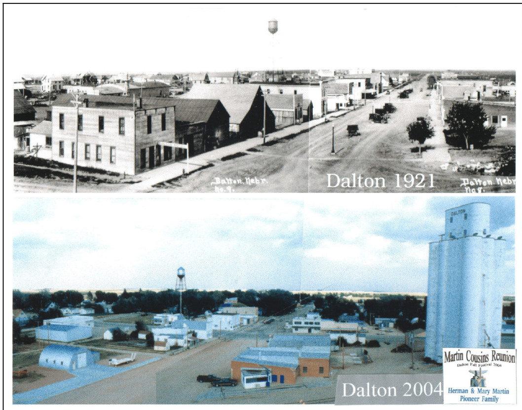
Comparative pictures of Dalton, looking from the west down Main Street. The top photo shows Dalton in 1921, the lower photo is how Dalton looked in 2004 during our reunion.