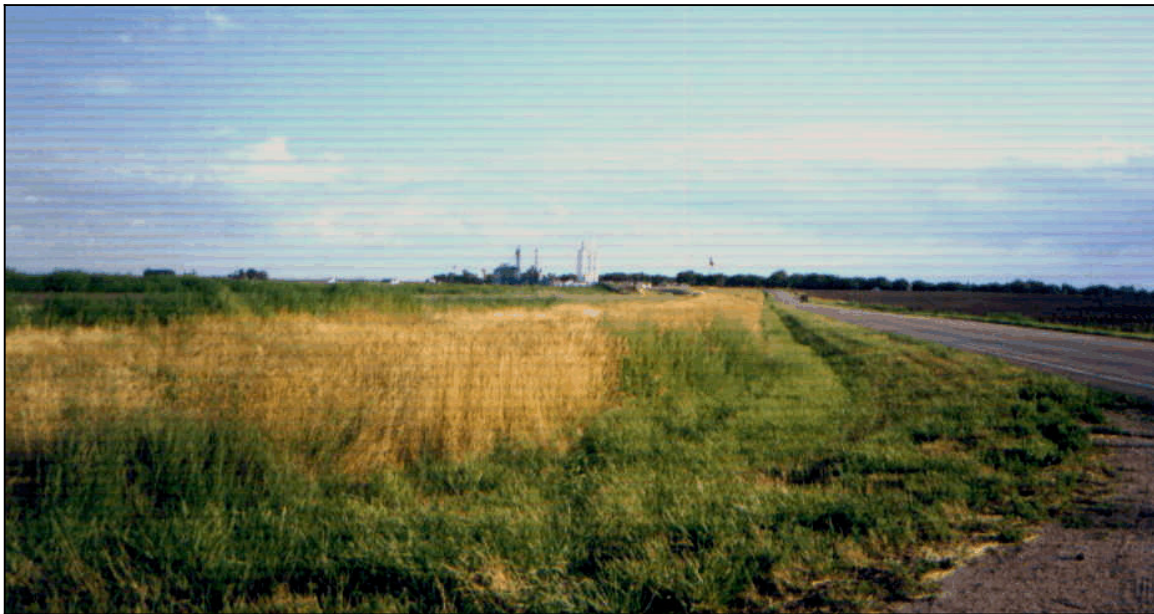
Dalton, Nebraska on the vast prairie of Cheyenne County, as it appears when approaching from the south on highway US 385. Photo 1996.